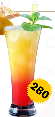
Bob Marley Mocktail